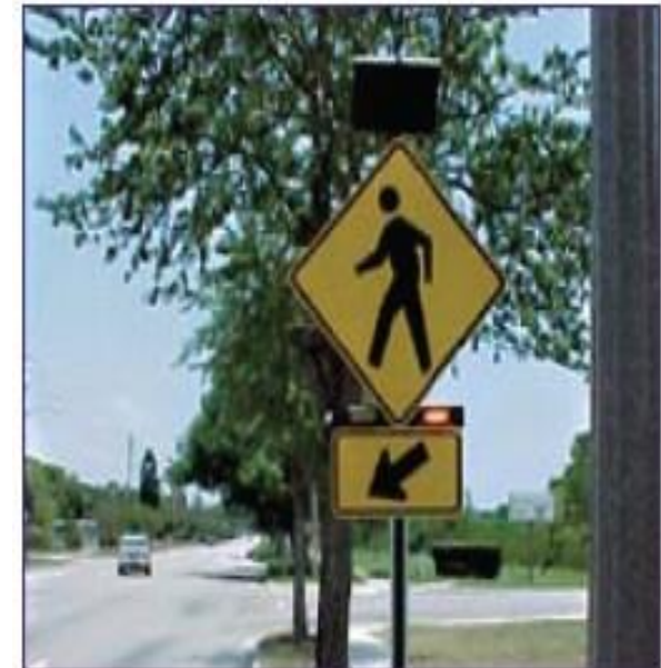
Figure 2: Activated, solar-powered, roadside RRFB at a mid-block crosswalk.

City of Allentown, Department of Public Works, Major Project Status, Fall 2015