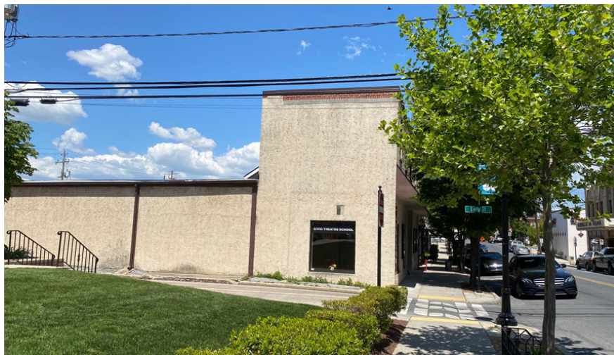
Location for new work of art