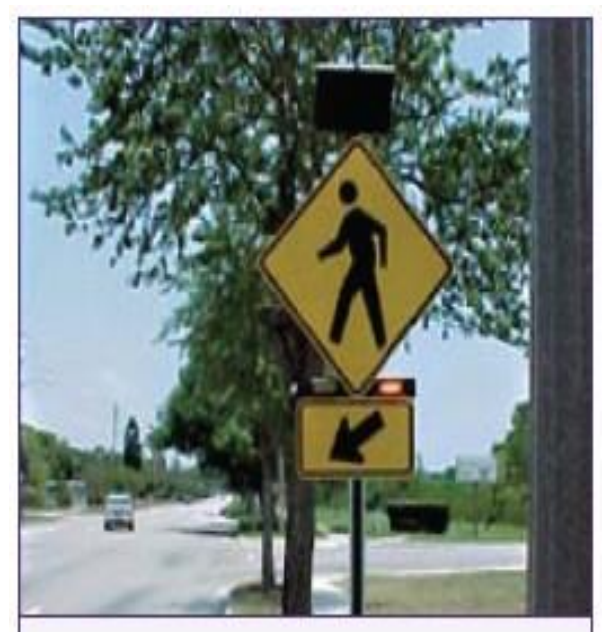
Figure 2: Activated, solar-powered, roadside RRFB at a mid-block crosswalk