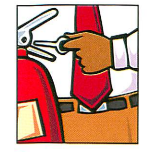
P-Pull the pin that unlocks the operating lever. (Some models may have other leverrelease mechanisms.)